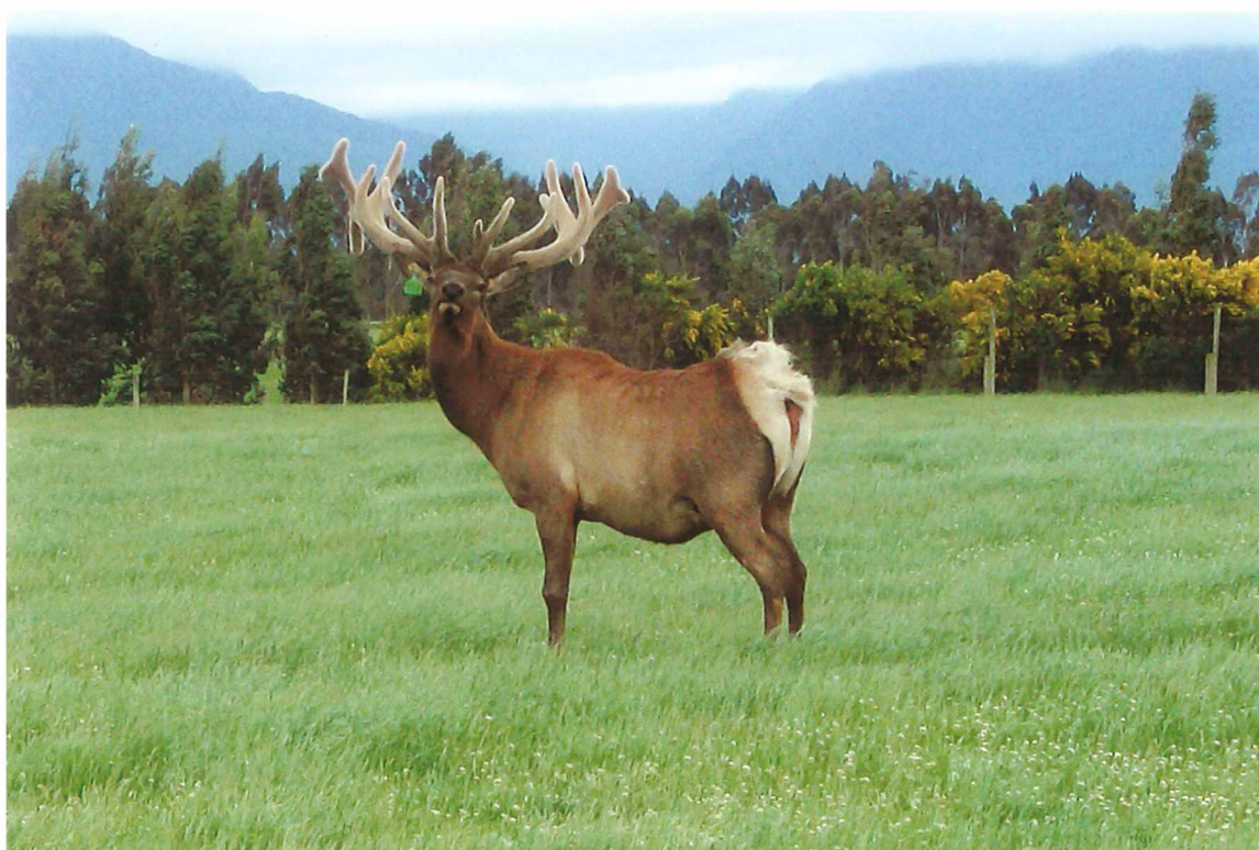
Stud Sire Bull (Green Tag 119 Tikana)